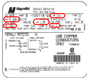
Typical Motor Name Plate